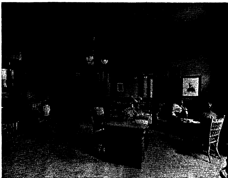
Reception Room and Office of Preceptress.