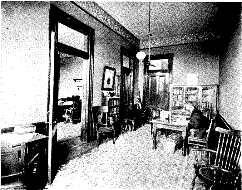
President's Private Office.